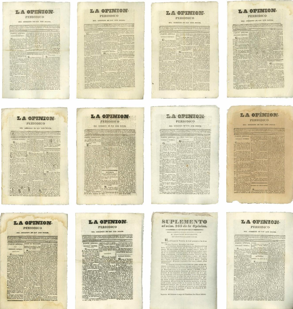
Issues of La Opinion , October-December 1836