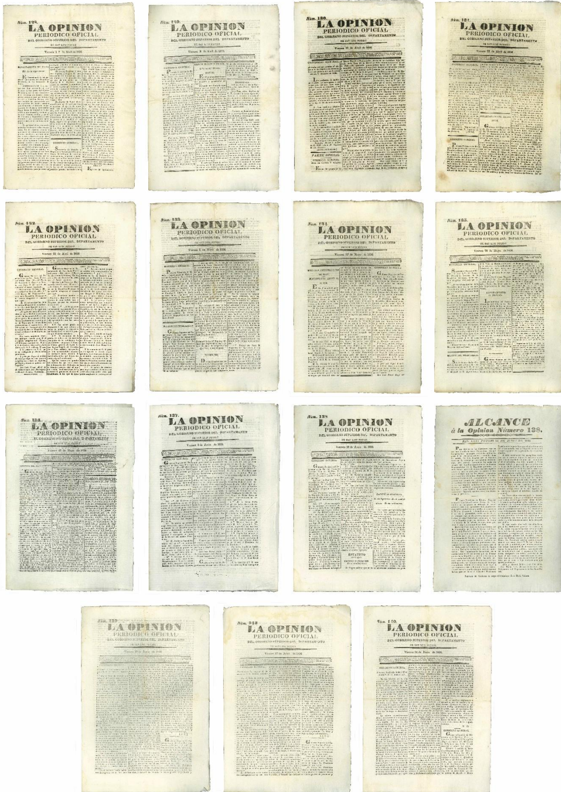
Issues of La Opinion , April-June 1836