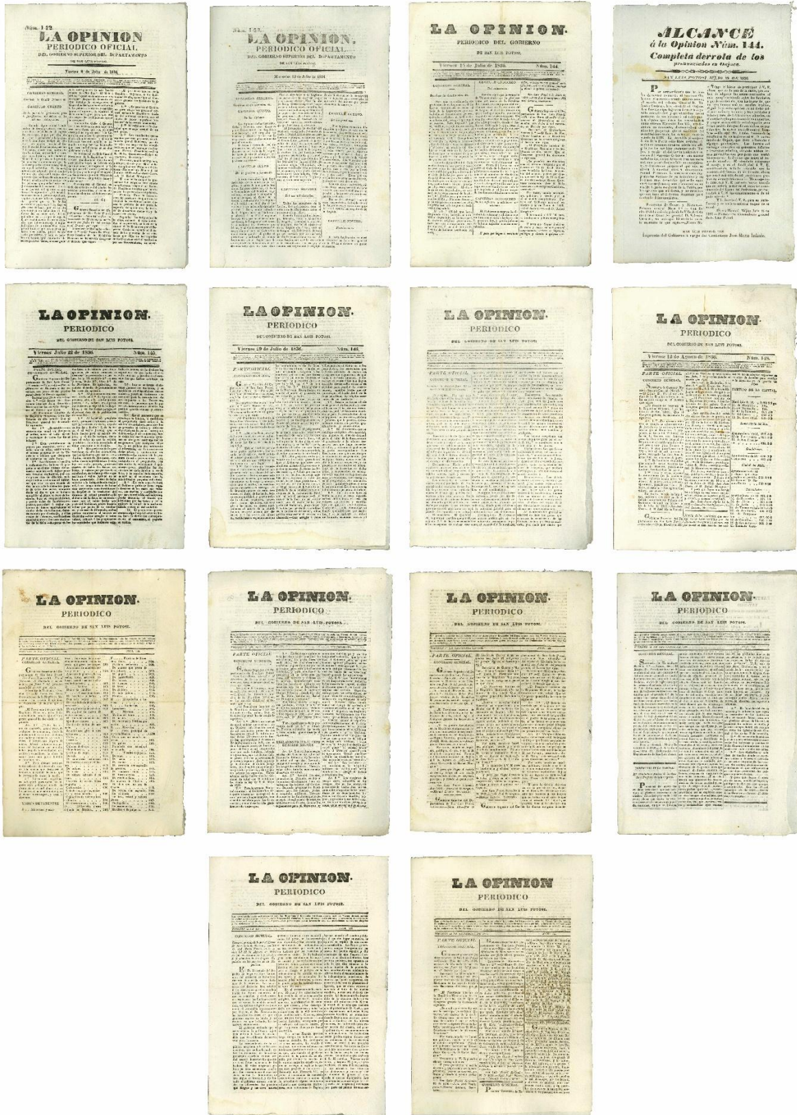
Issues of La Opinion , July-September 1836