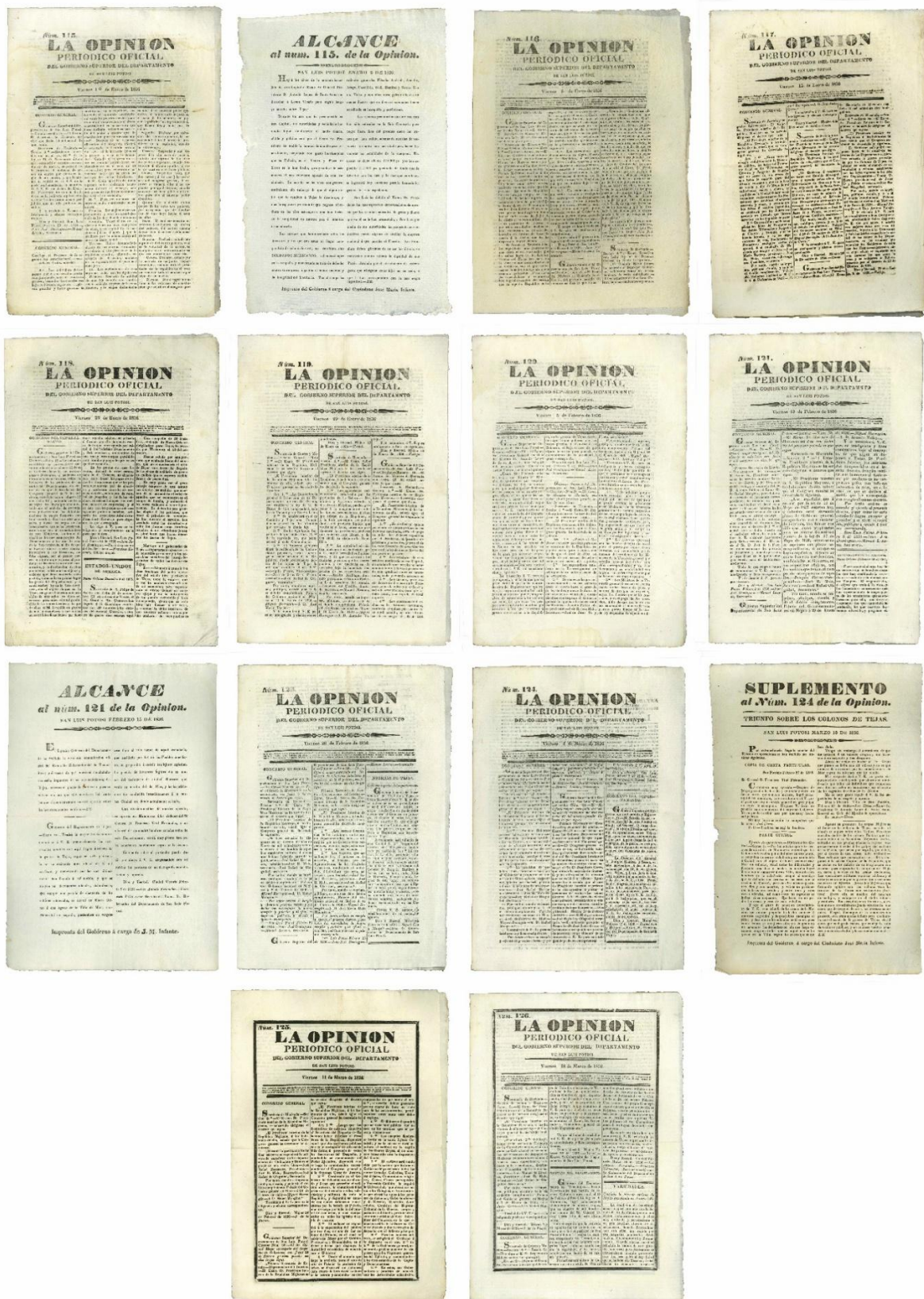
Issues of La Opinion , January-March 1836